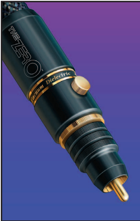
Illustration 2. “The Zero” RCA plug, equipped with a valve that allows a vacuum to be drawn inside the air-tube.

tor ends” without causing vacuum leaks, but should not be sharply bent anywhere between these flexible end segments. Also, obviously, any attempt to remove the screw-down crowns of the valves on the RCA/XLR connectors—or to disassemble the connectors themselves—may result in loss of vacuum and the voiding of warranties. 4